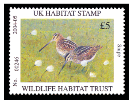
United Kingdom Snipe by Darren Rees.