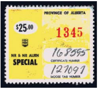
1976 Special Moose & Bear

In the year 1967, a special moose and bear stamp was issued for the first time. The April 1969 BNA Topics contained a short article on these stamps under the Canadian Revenue Study Group. The article stated: "A special moose and bear stamp was