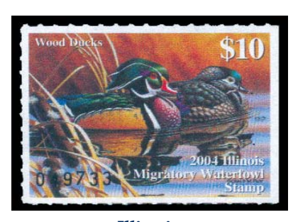
Illinois Wood duck