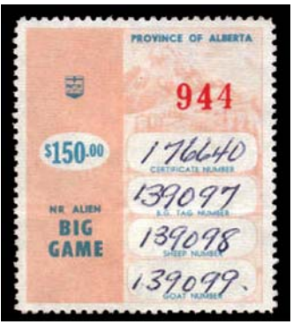
1965 Big game NR alien

Very few articles have been written concerning these