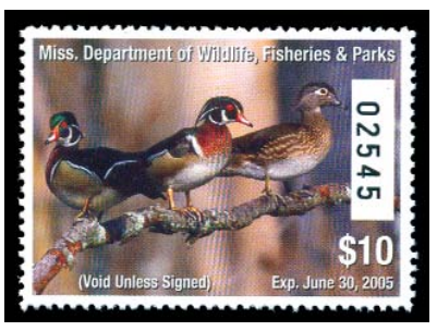
Mississippi Wood duck