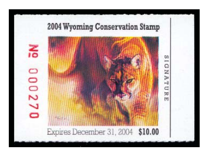
Wyoming Mountain lion