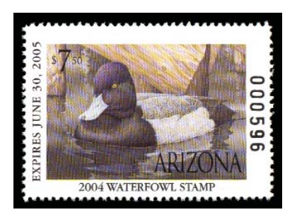
Arizona Lesser scaup