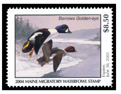
Maine Barrow's goldeneye