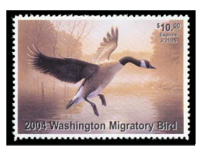
Washington Canada goose