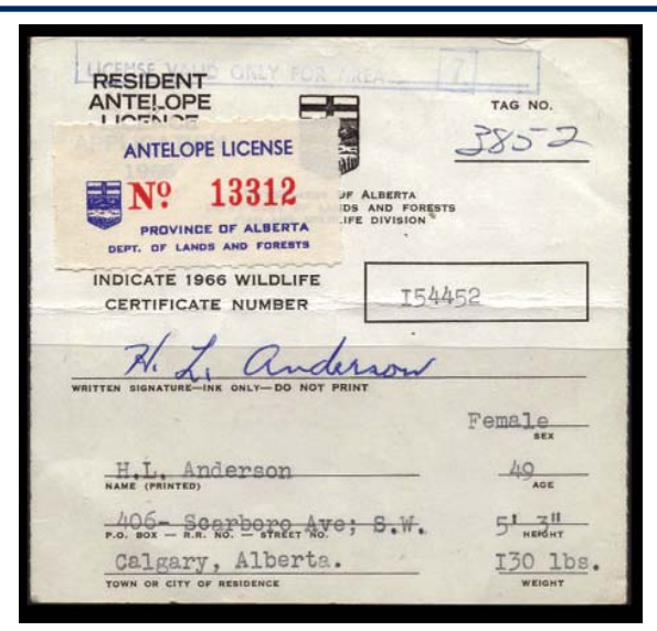
Antelope on license