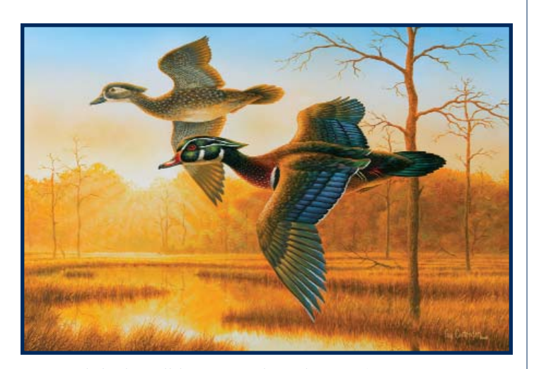
Wood ducks will be pictured on the 2005 Virginia stamp.

The 2005 stamp will picture a wood duck pair by artist Guy Crittenden. Stamps are normally available July 1.