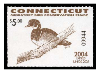
Connecticut Wood duck by Paul Fusco.