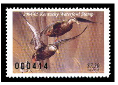
Kentucky Black duck by Chris Walden.