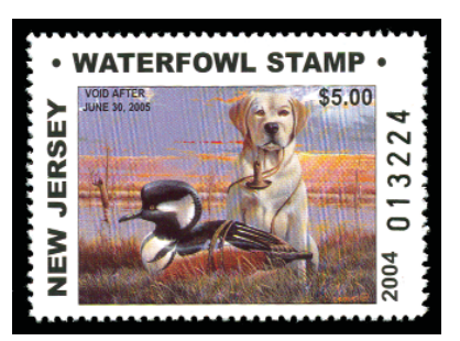
New Jersey Hooded merganser, yellow lab and decoy by Phillip Crowe.