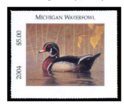
Michigan Wood duck