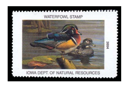
Iowa Wood duck by Dietmar Krumrey.