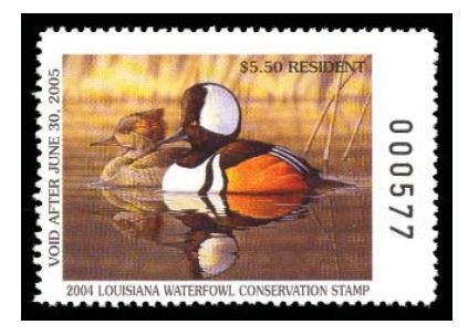
Louisiana Hooded merganser