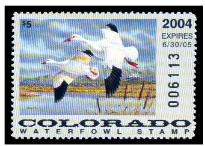
Colorado Snow goose