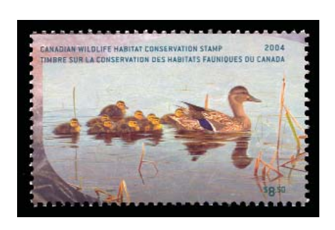
Canada Mallards