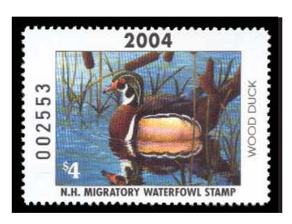
New Hampshire Wood duck by Lindsey Rothe.