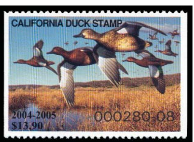
California Cinnamon teal.