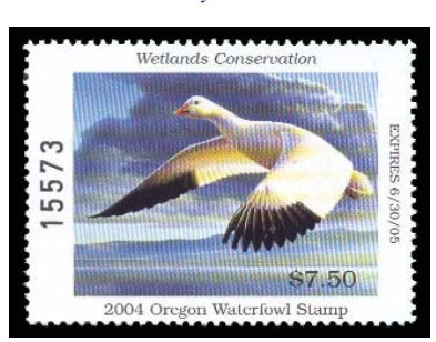
Oregon Ross' goose