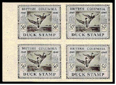
British Columbia's voluntary stamps.

With these issues, the principle of voluntary stamps (some would call "charity labels") was well established in Canada. The next issue was from the Winnipeg (Manitoba) Game and Fish Association and pictured a Canada goose.