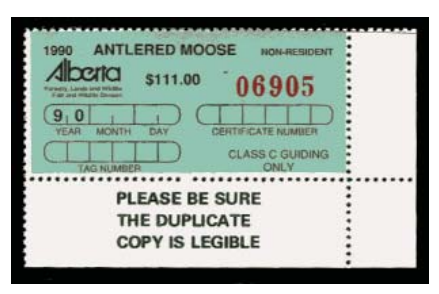
1990 mint stamp

to collectors: no mint exist as all remainders are destroyed at the end of each year. Also, I have a suspicion no collector could buy such high-powered stamps ostensibly as if he was going to hunt the game. To get any of the $1,750 worth, he would have to be a non-Canadian. The stamps are sold one at a time for inclusion on a special certificate. The people in charge would never permit him eleven dif-