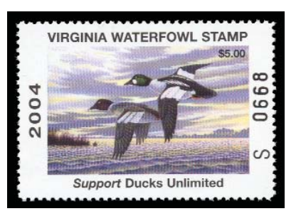
Virginia Am. Goldeneye