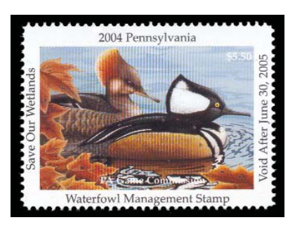
Pennsylvania Hooded merganser.