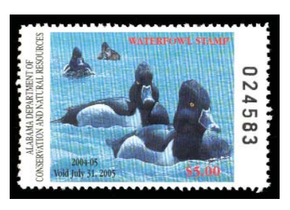
Alabama Ring-necked duck by David Sellers.