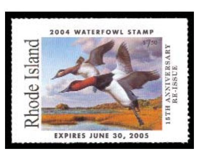
Rhode Island Canvasback by Robert Steiner.