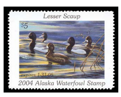
Alaska Lesser scaup by Cynthie Fisher.