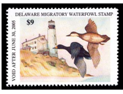
Delaware Black scoter and Cape Henloren lighthouse by Bonnie Field.