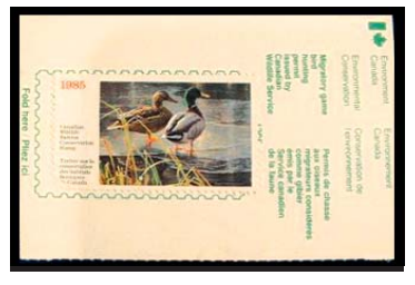
1985 Canada on license.

With the exception of the first stamp that was issued only as a single stamp sheetlet in a descriptive booklet, all the stamps in the series have been issued