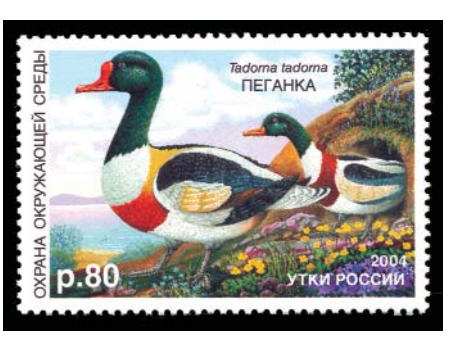
Russia Red-Billed Shelduck