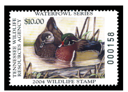
Tennessee Wood duck